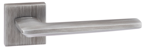
Finish Photographed: Urban Graphite